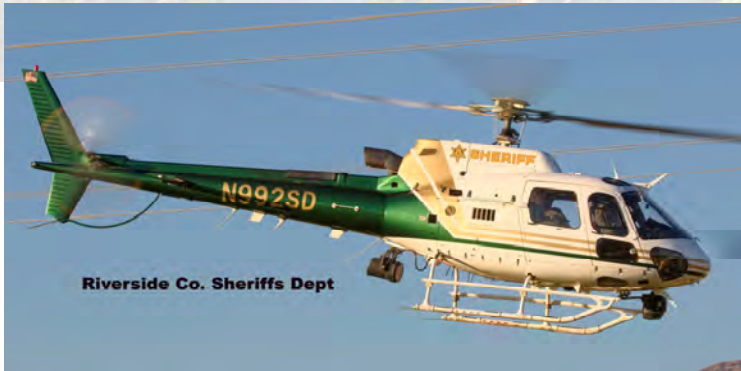
Riverside Co. Sheriffs Dept