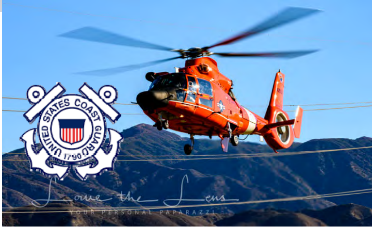
Above, ... U.S. Coast Guard San Francisco Air Station arriving from their forward operating base at Pt. Mugu CA.