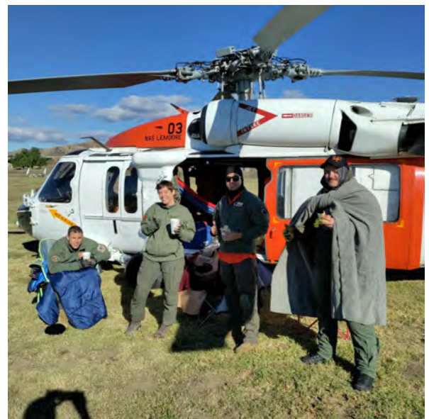
Below, Lasso 1 crew of Lemoore NAS / SAR spent a cold night at Hansen Dam due to mechanical issues. The AHAS volunteer team was happy to find them in good spirits when we delivered breakfast Sunday AM