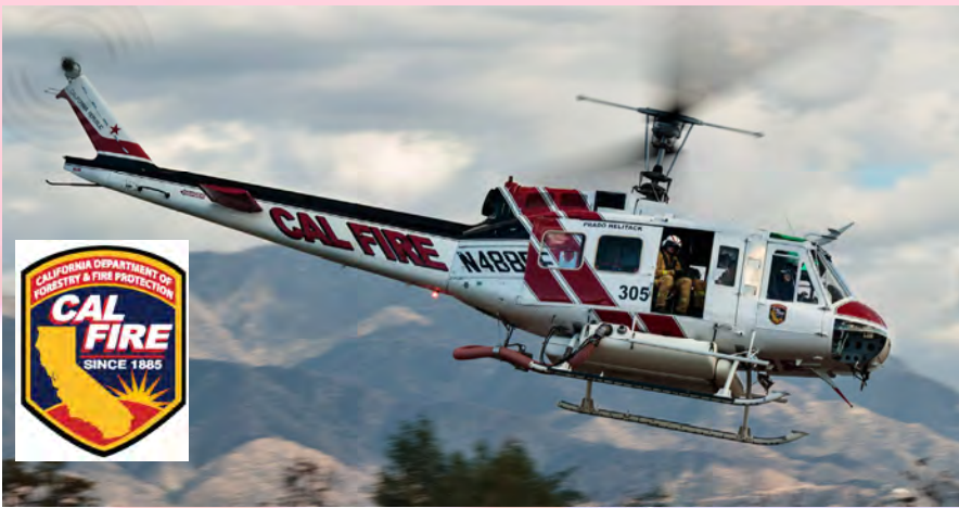
Exactly 1 week after our event these firefighters and others were stretched to the limit battling the Woolsey Fire as it destroyed 1,500 structures and burned 96,949 acres on its way to the Pacific ocean.

Our volunteer team goes to great lengths each year to present a diverse group of helos from FIRE / RSQ teams. Their participation and demonstrations support our event mission of educating the public, media and public officials about the value of rotary-wing aviation.