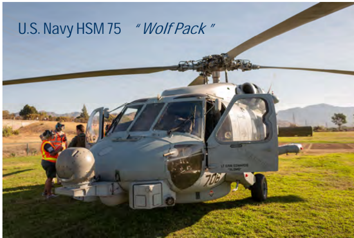
U.S. Navy HSM 75 "Wolf Pack"

left, ... U.S. Navy Helicopter Maritime Strike Squadron / HSM 75 "Wolf Pack" arrives from their base at NAS North Island—San Diego . Flying the Sikorsky MH-60R helicopter on a variety of missions including undersea & Surface warfare ... Stay connected with the pack !