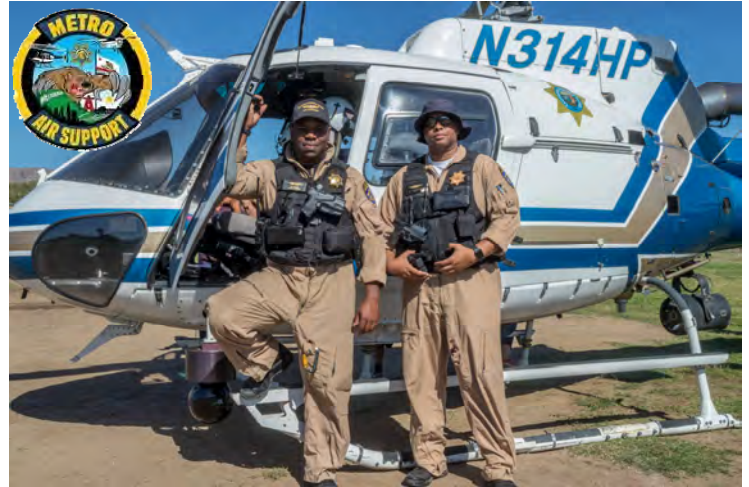
Above, ... CHP Aviation unit joins us from their base at Fullerton.