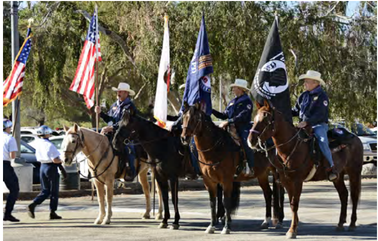
Above, the LAPD Rough Riders Cavalry prepare to honor & welcome new U.S. Citizens !