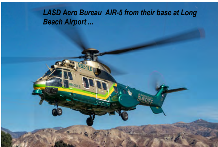
LASD Aero Bureau AIR-5 from their base at Long Beach Airport ...