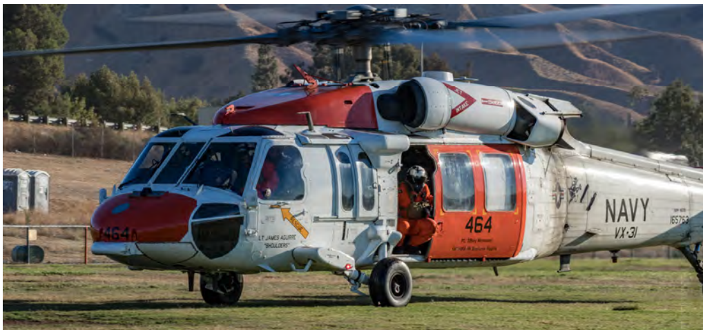
U.S. Navy NAS China Lake VX-31 'Dust Devils' Search & Rescue team A/C call sign: " COSO "