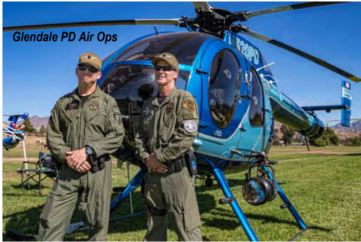
Glendale PD Air Ops