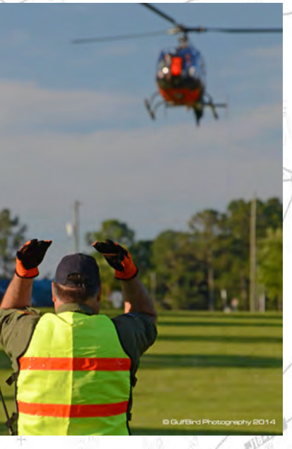
Introducing families to the Heroes they can really Look up to ...