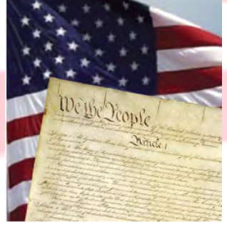
Learn more about the USCIS mission at their website www.USCIS.gov