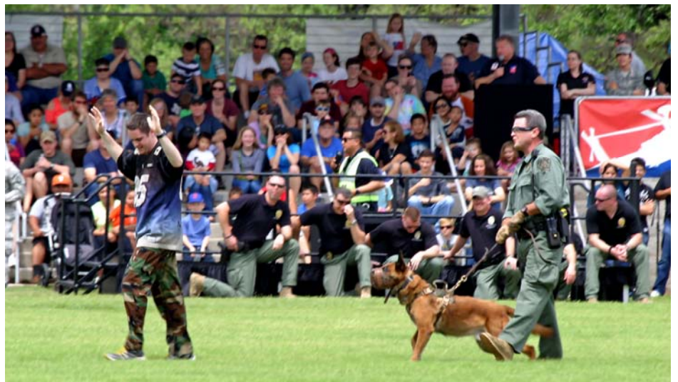
Above, Austin PD Canine team demos tactical ops for crowds to highlight career opportunities with Austin PD.