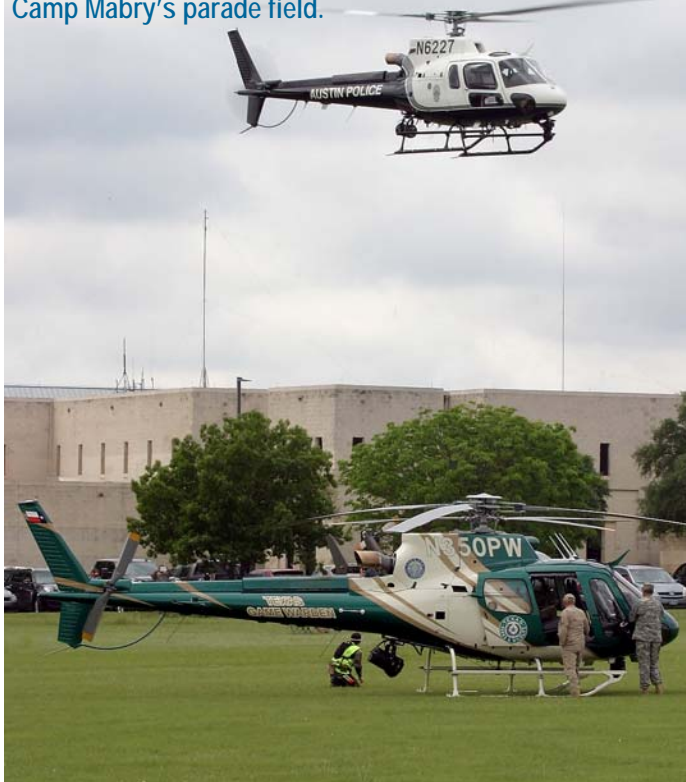
below, Austin PD A-Star is on short final while the team from Texas Parks & Wildlife—Air Ops has just landed at Camp Mabry's parade field.

The American Heroes Aviation Network is proud to be an Affiliate member of HAI and participate in a mission to educate the community about the value of helicopters' service.