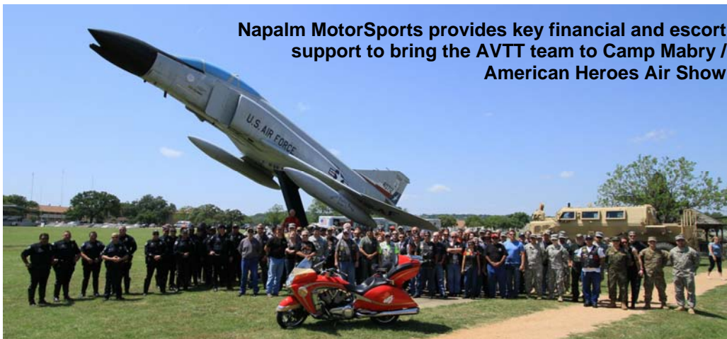
Napalm MotorSports provides key financial and escort support to bring the AVTT team to Camp Mabry / American Heroes Air Show