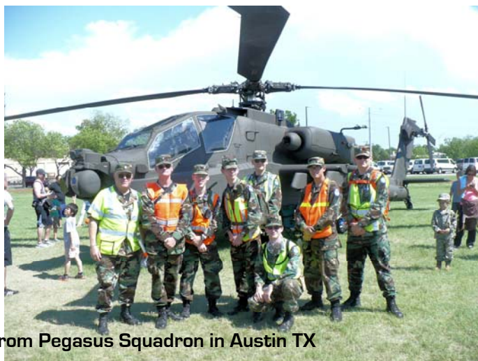
Civil Air Patrol Cadets from Pegasus Squadron in Austin TX