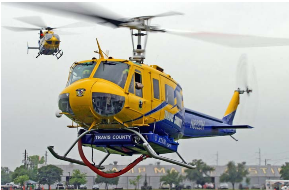
Above, the crew from Austin / Travis CO. STAR Flight arrives at Camp Mabry in their Bell UH-1H "Huey" equipped for fire suppression work ... Followed by their inbound EC -145.