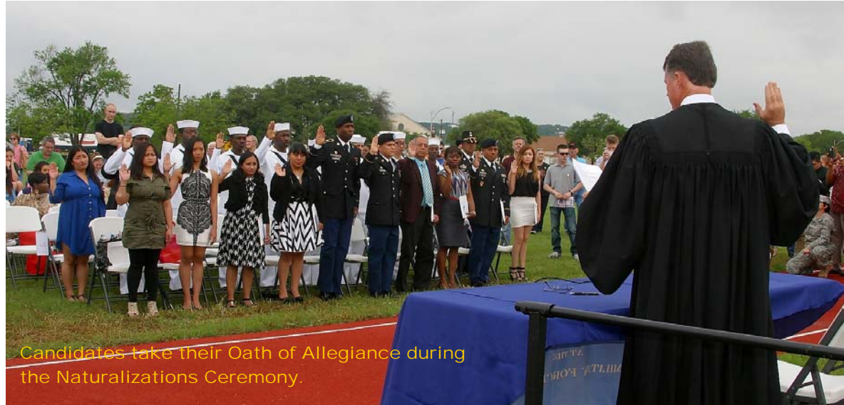
Candidates take their Oath of Allegiance during the Naturalizations Ceremony.