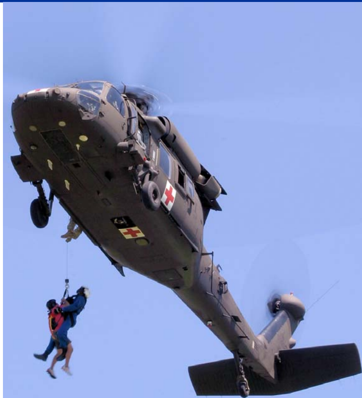
One of the highlights of the Open House is the annual tactical demonstrations of rotary-wing capabilities by the Texas Military Forces aviation units.

Military, LEO, EMS and community service were all on deck at the 2015 American Heroes Air Show — TX.