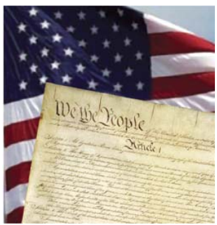
Learn more about the USCIS mission at their website