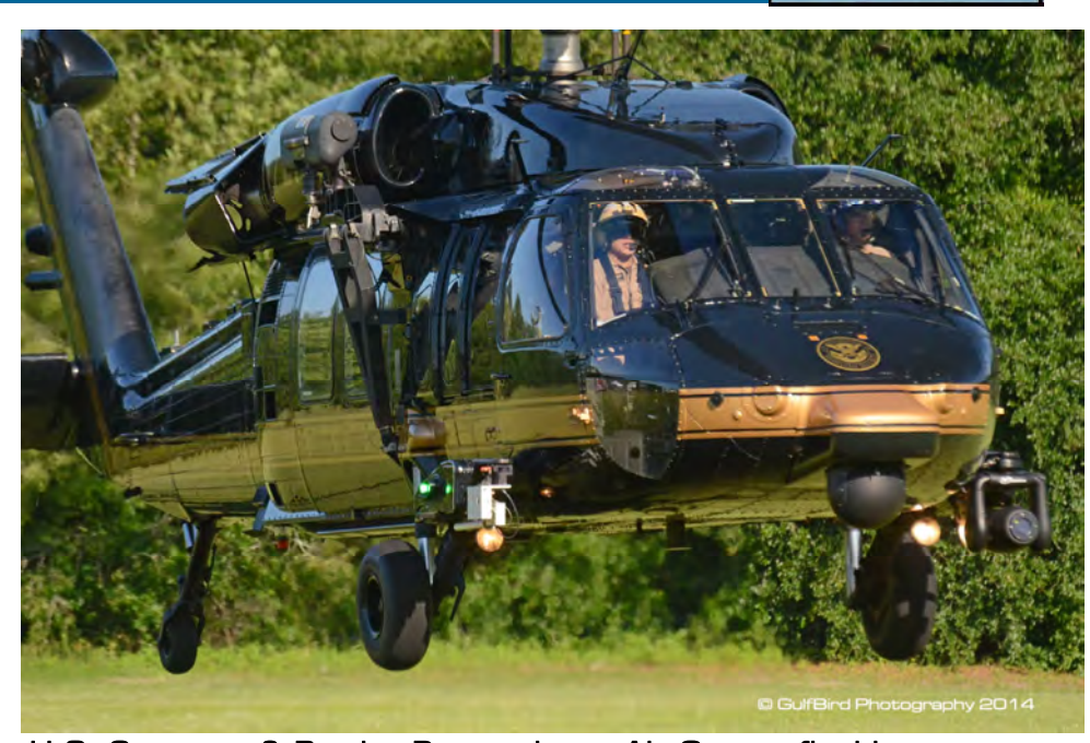
U.S. Customs & Border Protection - Air Ops on final into Santa Fe College / Gainesville from their base in Miami.