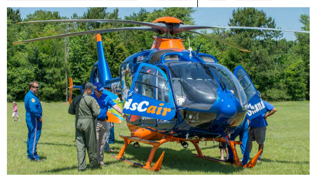
The American Heroes Aviation Network is proud to be an Affiliate member of HAI and participate in a mission to educate the community as to the value of helicopters' service.

A diverse collection of helicopters at the Heroes event educates the Gainesville FL. community, elected officials and the media about the critical role of rotary-wing aviation in local law enforcement, fire service, EMS transport, homeland security and national defense.