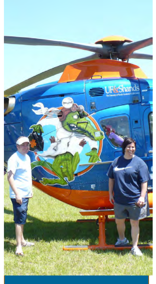
University of Florida & ShandsCair arrives on scene with their new EC-135 from Airbus Helicopters.

Once again the American Heroes Air Show lands at the Santa Fe College in the heart of Gainesville, Florida.