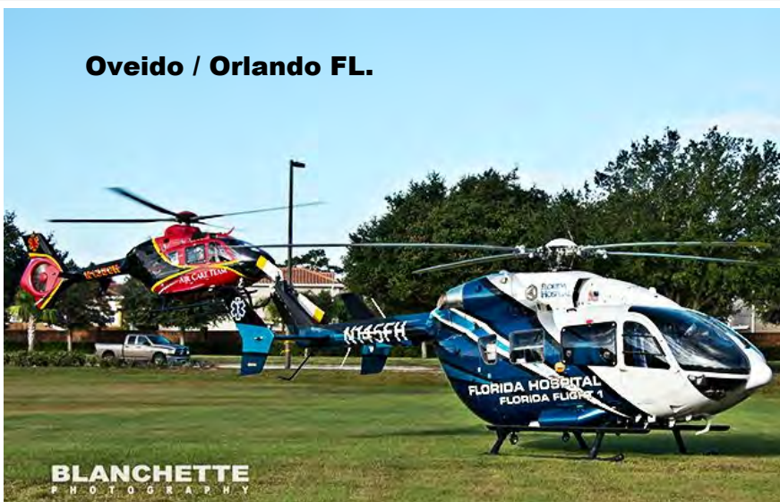
Oveido / Orlando FL.