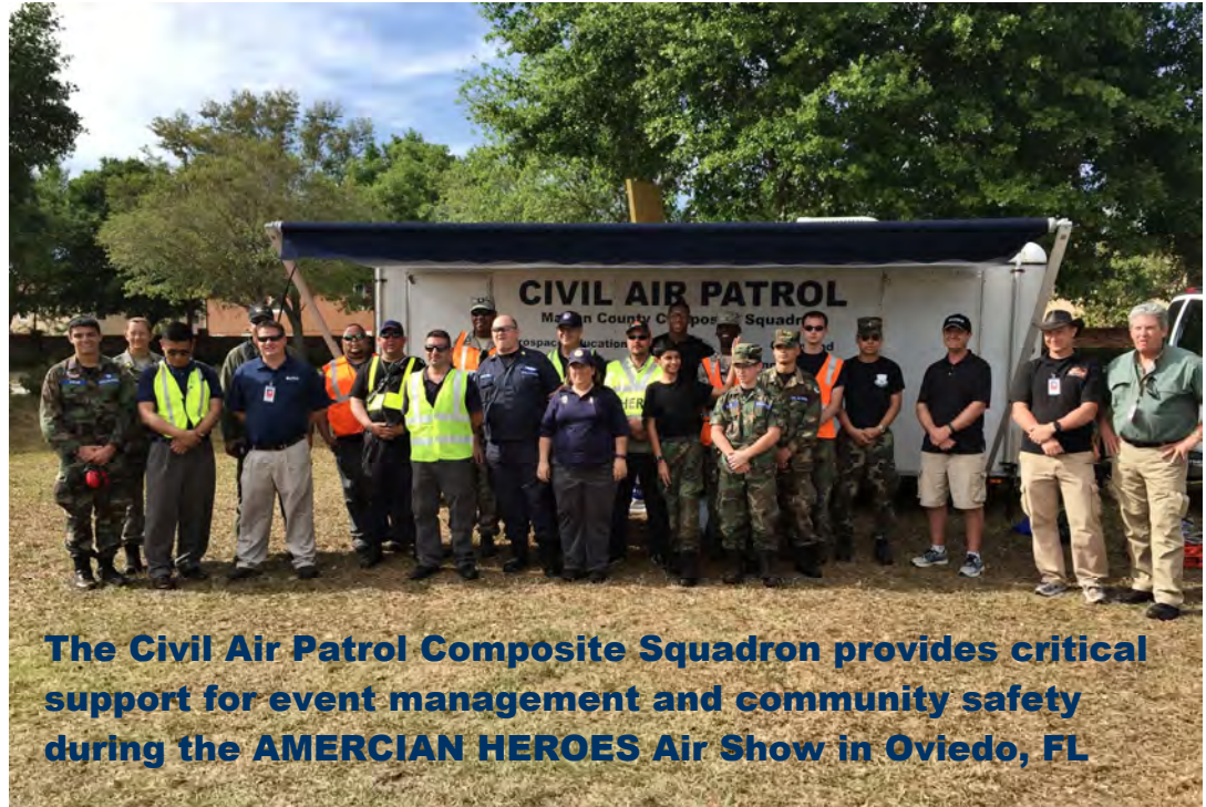
The Civil Air Patrol Composite Squadron provides critical support for event management and community safety during the AMERICAN HEROES Air Show in Oviedo, FL

It is a privilege to welcome back the Vietnam Helicopters Pilots Association. For a number of years now the VHPA has trailed in their LOACH helicopter to profile the unique value and capabilities rotary-wing aviation delivered to our troops in Viet Nam ... www.VHPS.org