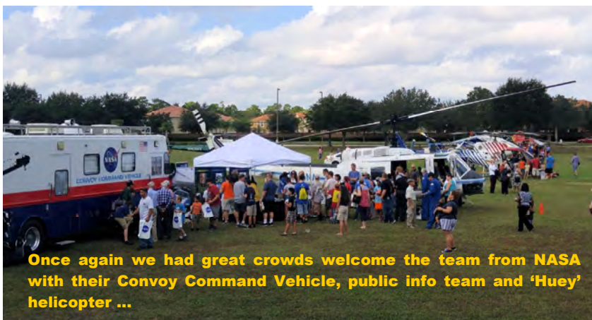
Once again we had great crowds welcome the team from NASA with their Convoy Command Vehicle, public info team and 'Huey' helicopter ...

One of our most popular event elements, the CODE3 Career Expo provides free presentation space to recruiting teams to meet the public with information on careers in law enforcement, aviation, homeland security and the military .