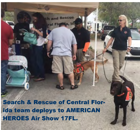
Search & Rescue of Central Florida team deploys to AMERICAN HEROES Air Show 17FL.

One of our most popular event elements, the CODE3 Career Expo provides free presentation space to recruiting teams to meet the public with information on careers in law enforcement, aviation, homeland security and the military .