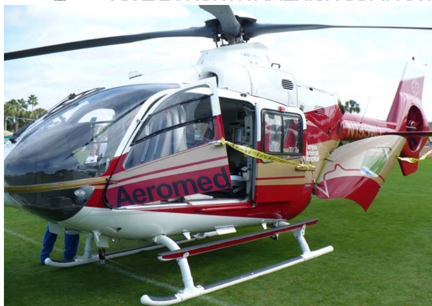
AEROMED team joins the American Heroes Air Show in Fort Myers from their base at Tampa General Hospital