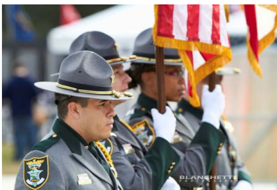
Lee County Sheriffs Honor Guard