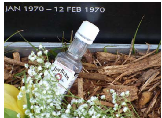
Just one of the unique memorials left at the AVTT Vietnam Memorial Wall in FL