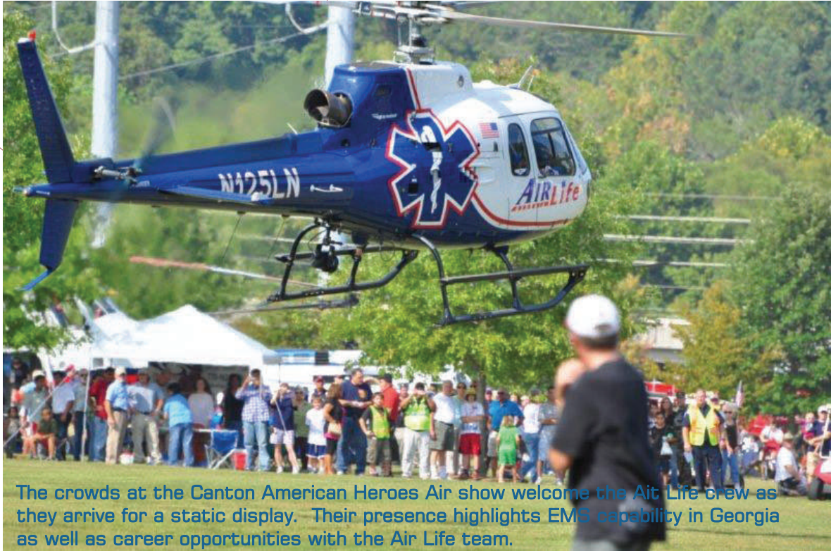
The crowds at the Canton American Heroes Air show welcome the Air Life crew as they arrive for a static display. Their presence highlights EMS capability in Georgia as well as career opportunities with the Air Life team.