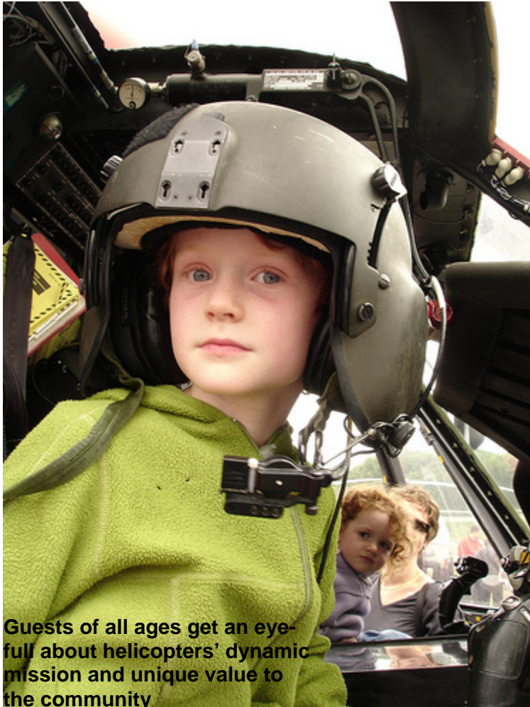
Guests of all ages get an eye-full about helicopters' dynamic mission and unique value to the community