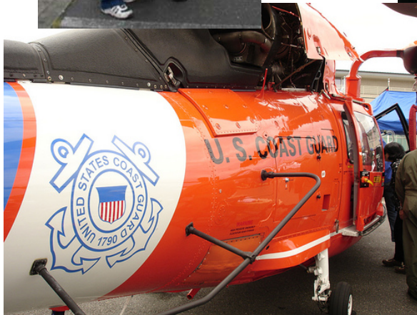
Once again U.S. Coast Guard aircraft and recruiting teams arrive from Port Angeles and Astoria Air Stations.