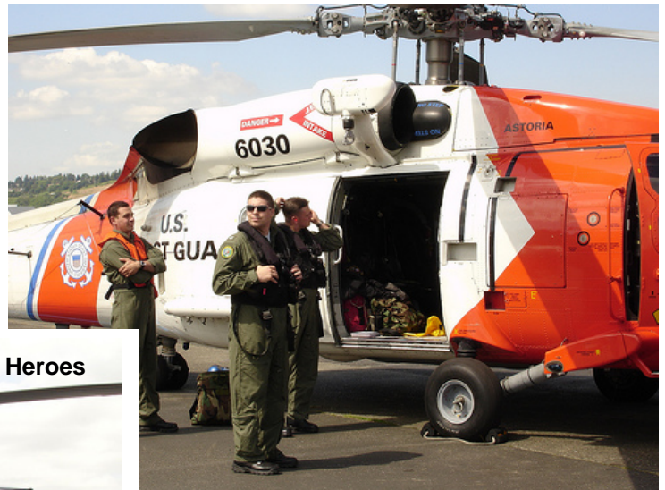
2008 was the first year for the DEA at the American Heroes Air Show in Seattle -